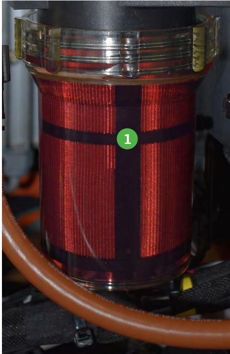
1 NEW: Enhanced Fuel Filtration that supports common-rail fuel injection.